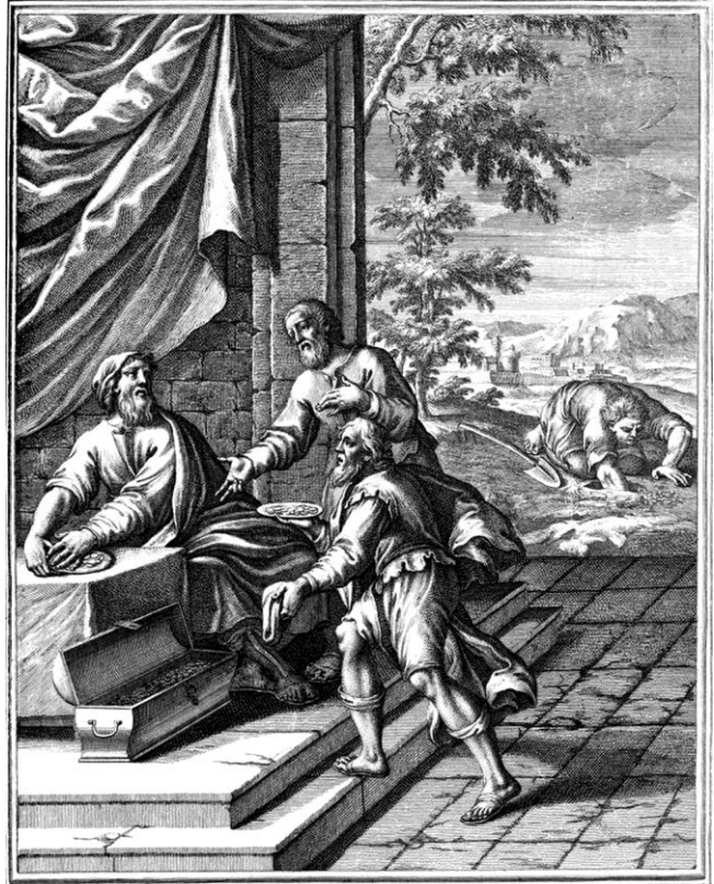
The Parable of the Talents from Historiae celebriores Veteris Testamenti Iconibus representatae, artist unknown, 1712, public domain.

Pastor’s email: pastor@gracelutheranelcentro.org