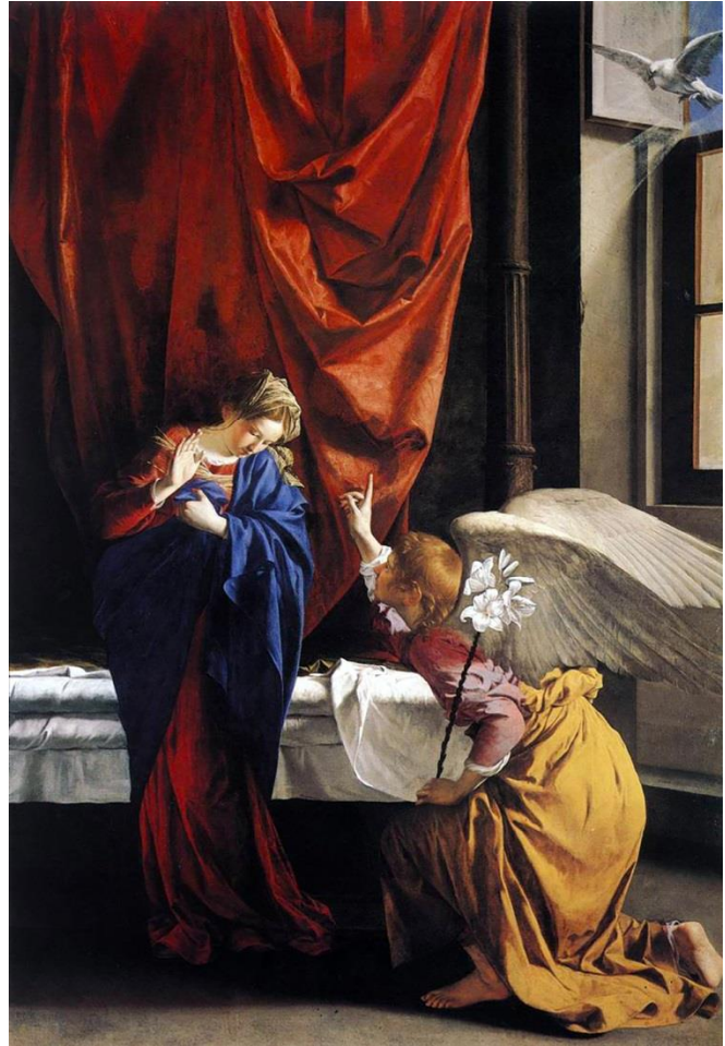
The Annunciation by Orazio Gentileschi, circa 1623

Pastor's email: pastor@gracelutheranelcentro.org